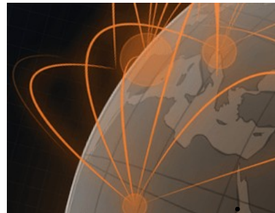
Worldwide Social Network