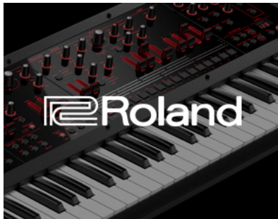
Roland Featured Products